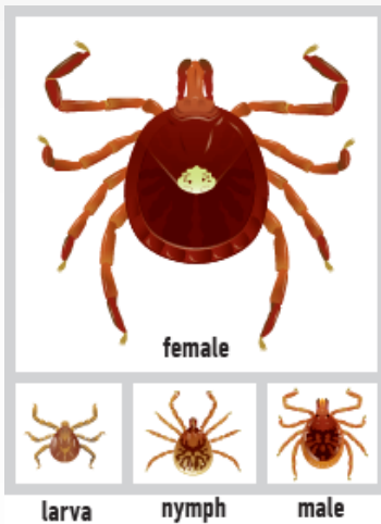
Lone star tick