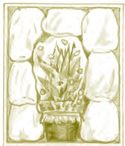
Inflated plastic bags protect sample during shipping