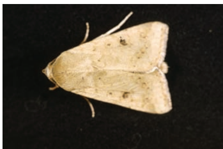
Fig. 2. Adult male corn earworm.