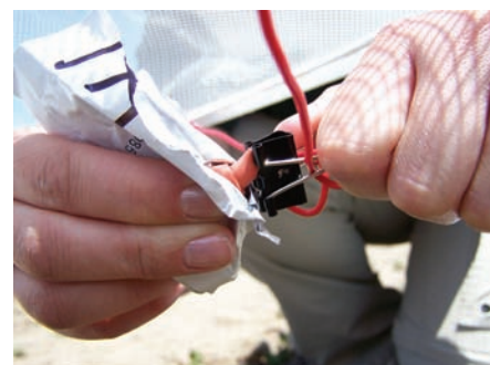
Fig. 6. Using the lure package to avoid cross-contamination.