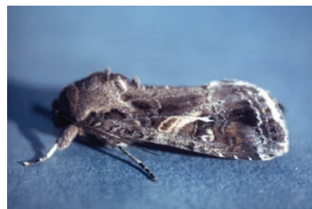
Fig. 3. Adult male fall armyworm.