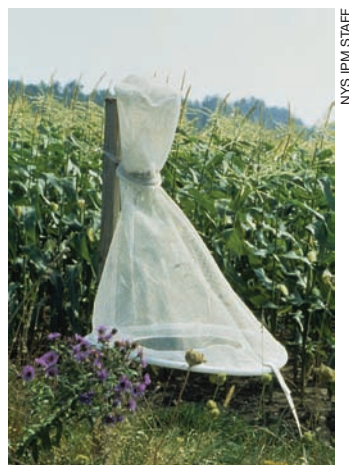
Fig. 4. Proper placement of Scentry™ Heliothis net trap for monitoring European corn borer and corn earworm.