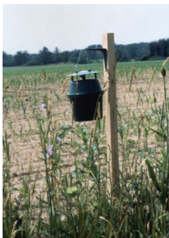
Fig. 5. Bucket-style universal moth trap (unitrap) for monitoring fall armyworm.