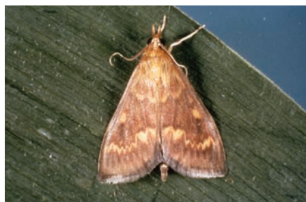
Fig. 1. Adult male European corn borer.

Pheromone traps have demonstrated value in monitoring populations of Lepidopterous (moth) insect pests in sweet corn,